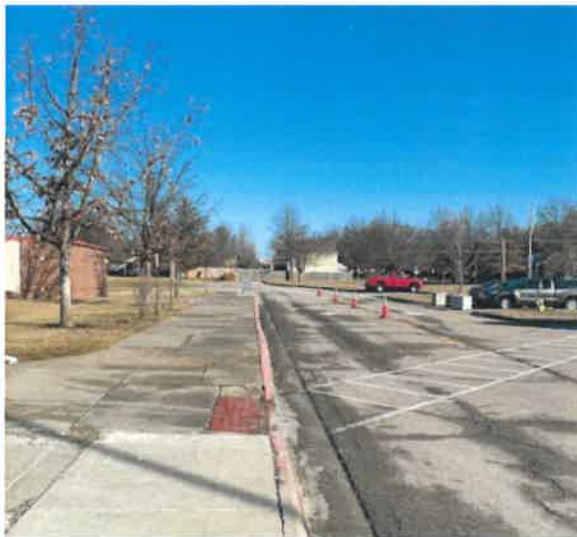
DROP OFF LANE ONLY. NO PARKING HERE

There is no parking in the drop off lane and there is no parking in front of, or next to the mailbox.