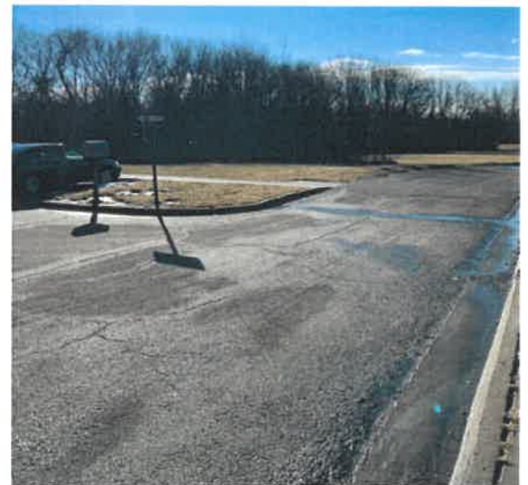
NO PARKING HERE